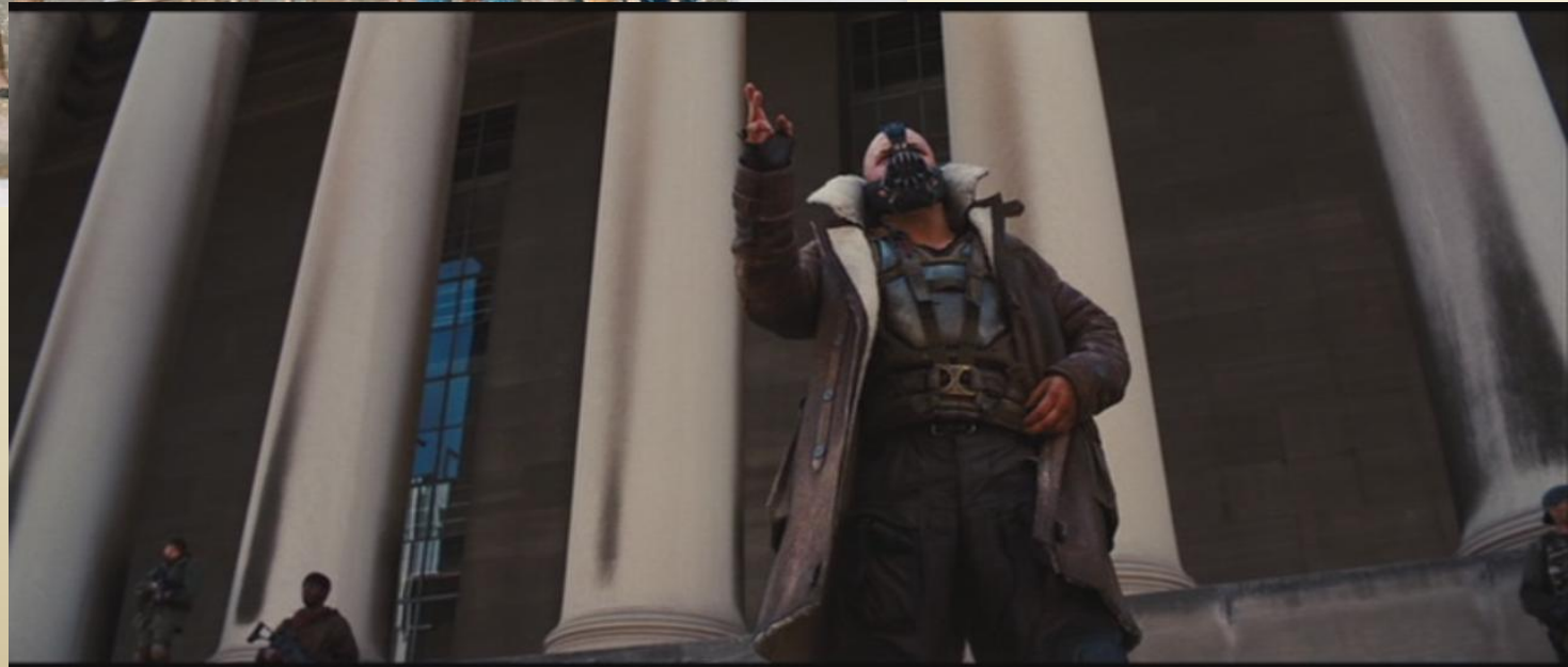
Screen capture from Batman: The Dark Knight Rises , directed by Christopher Nolan, 2012.