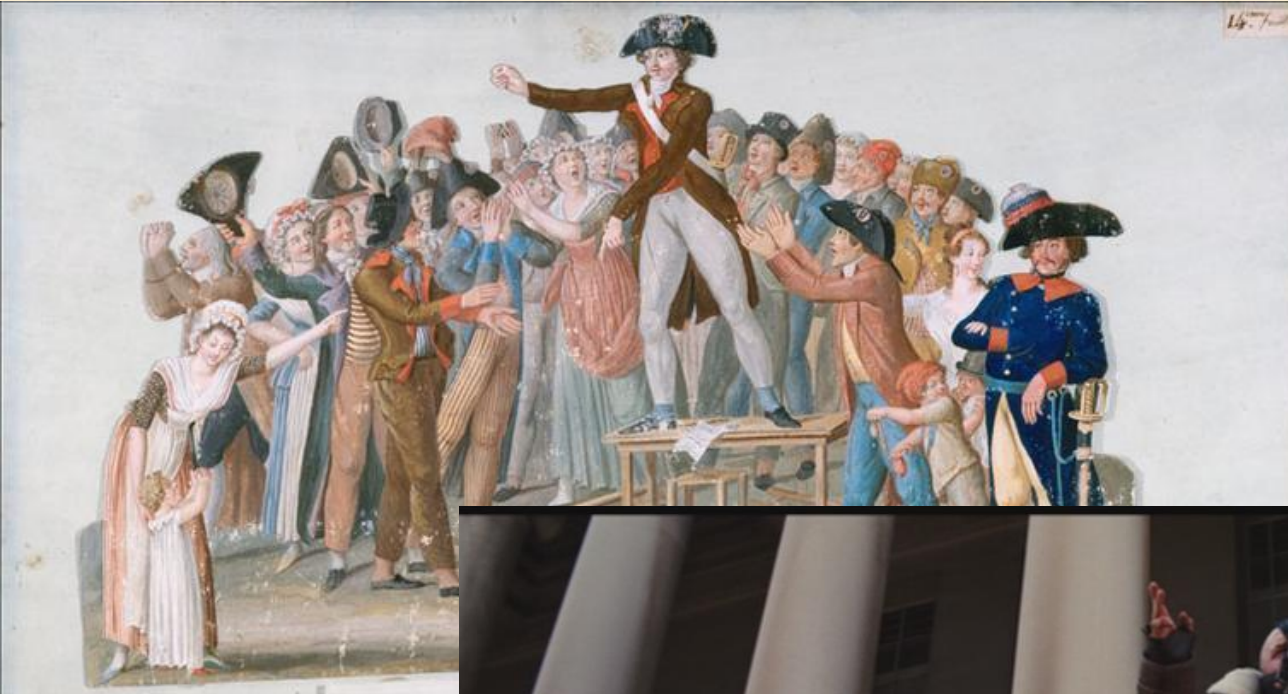
Jean-Baptiste Lesueur (1749-1826), Motion au Jardin du Palais Royal , c. 1792-1795

Batman: The Dark Knight Rises or How do the English sphere remember the Revolution?