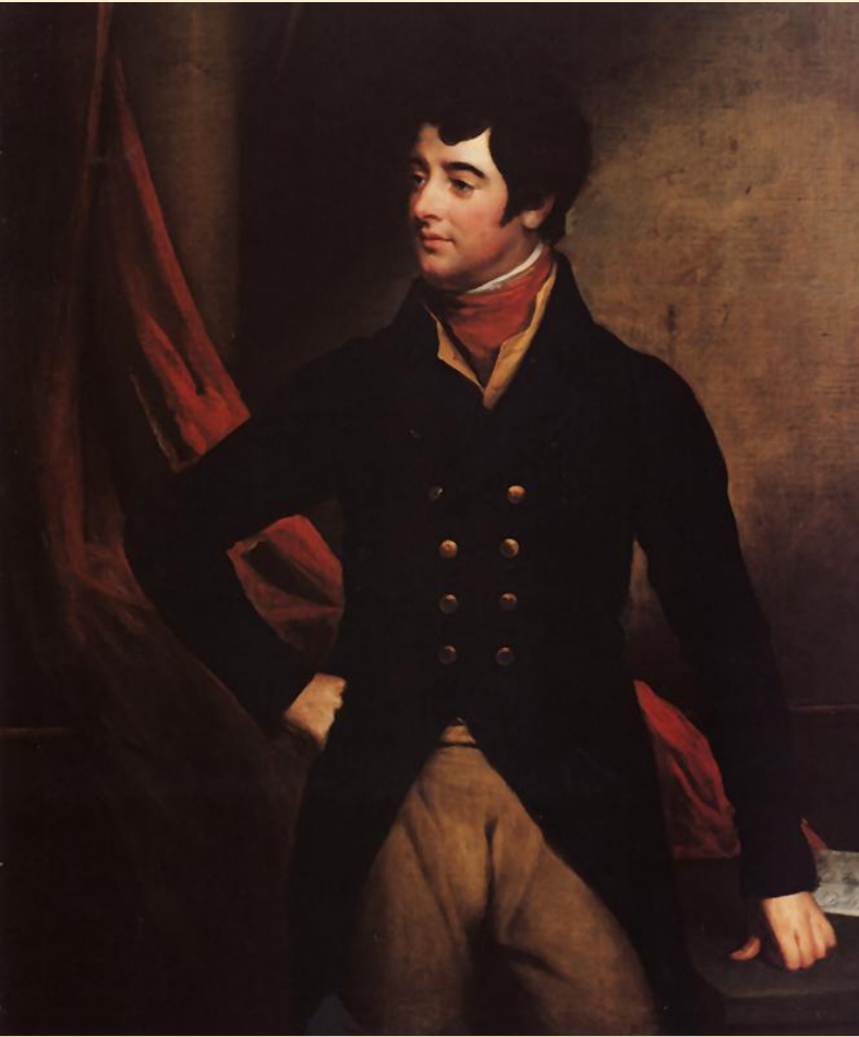
Hugh Hamilton Douglas, Lord Edward FitzGerald, c. 1797