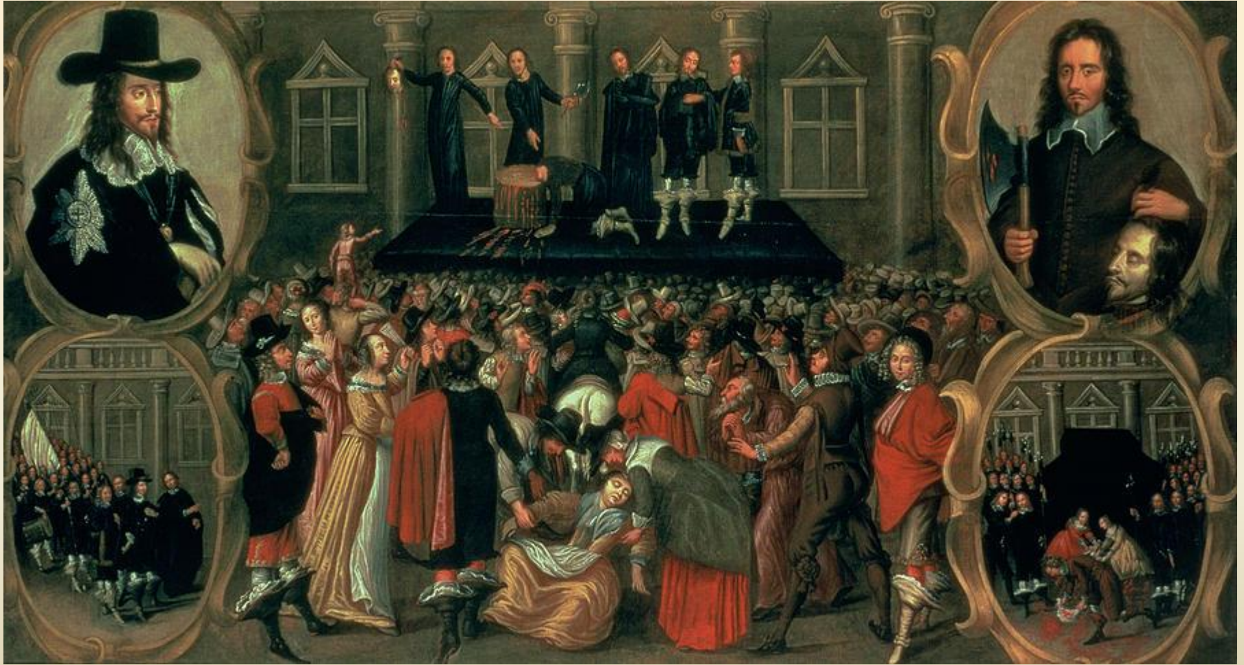
John Weesop, An Eyewitness Representation of the Execution of King Charles I (1600-49) of England , 1649.