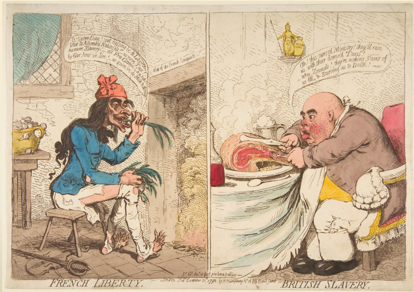
James Gillray, French Liberty, British Slavery , Hannah Humphrey, London, 21 Dec. 1792