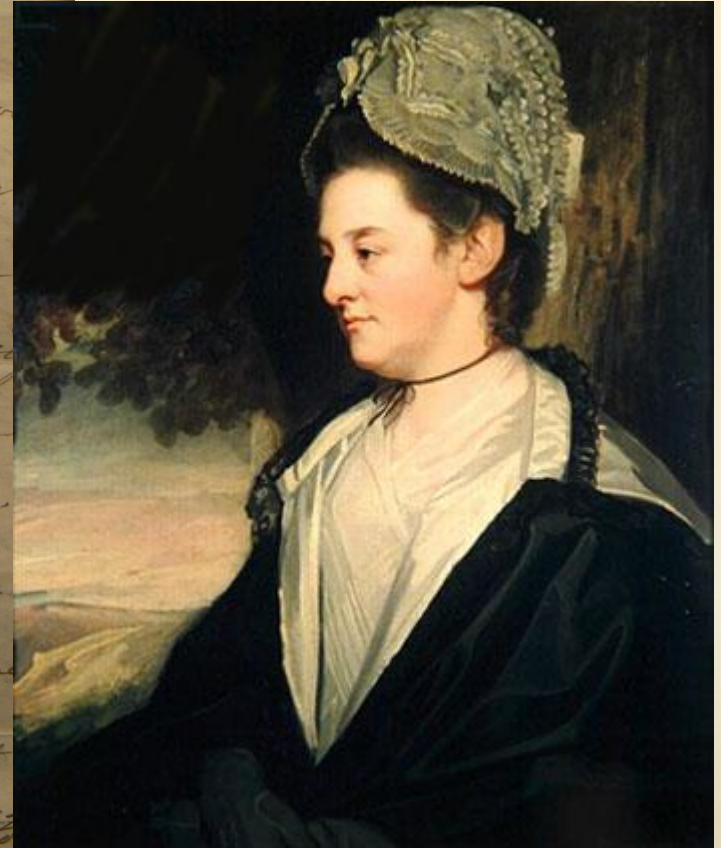
Louisa Conolly to Emily Lennox, 15 June 1778, NAI MS 611.

➤ Task: To make an online exhibition on the topic.